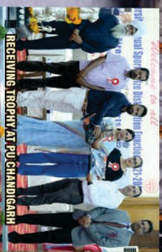
RECEIVING TROPHY AT P.U. CHANDIGARH

HISTORICAL MOMENT: OUR COLLEGE VOLLEYBALL TEAM PARTICIPATED FIRST TIME IN P U CHANDIGARH INTER COLLEGE VOLLEYBALL TOURNAMENT 2021-22 & WON GOLD